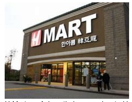
H-Mart, an Asian ethnic grocer located in Seattle, Washington

Ethnic grocers distinguish themselves from regular grocers by offering a wide variety of cultural products and ingredients that consumers can use to cook a wide variety of ethnic foods. Some ethnic grocers are family-owned small businesses, but there are numerous national chains including Asian stores H-Mart and Mitsuwa Marketplace as well as Hispanic stores