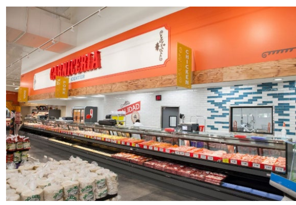
provides its customers with bilingual support.

Ethnic grocer centered retail centers are often successful because of their ability to bring together an ethnic community. A combination of The interior of a Cardenas grocery store with which the grocer anchor as well as surrounding small